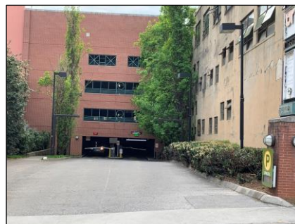
Walnut St (east) entrance of Locust Garage